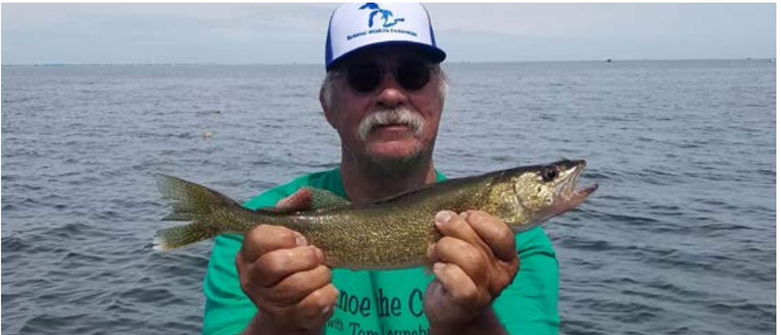
A walleye fished out of Saginaw Bay. The Frankenmuth Dam Fish Passage allowed walleye and similar fish spawning access to the Cass River, which had been denied to them for over a hundred years.

RESULTS AND ACCOMPLISHMENTS: Removing a risky dam and replacing it with natural rapids has opened up 73 miles of fish habitat and allowed vital Great Lakes fish species such as walleye and sturgeon access to their spawning habitats, restoring their populations to Saginaw Bay.