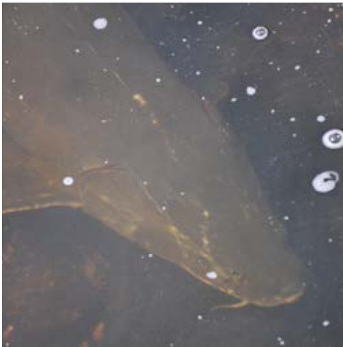
Lake Sturgeon, like the one pictured above, are being monitored in the Niagara River to ensure a healthy population rebound.

State-of-the-art monitoring technology ensures stable, healthy population growth and recovery for threatened lake sturgeon.