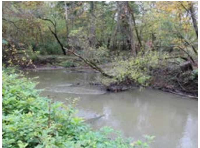
Before restoration, exposed streambanks were vulnerable to erosion and habitat destruction.

TYPES OF JOBS CREATED: Landscaping, research, general labor.