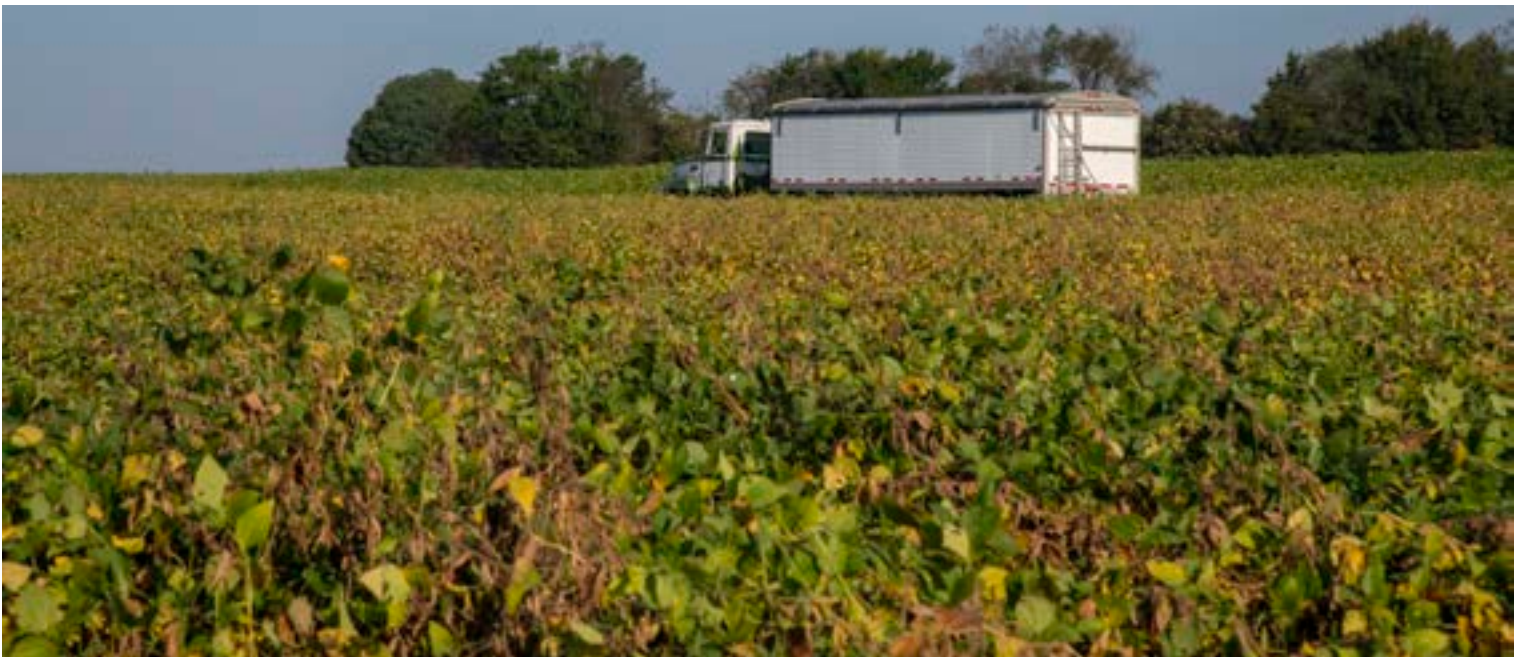
Farms like the one pictured above have used farm conservation practices to improve soil and water health in Harris County, Pa., which ultimately helps restore the health of Lake Ontario.

RESULTS AND ACCOMPLISHMENTS: The establishment of a demonstration farm network in Potter County, Pa., has provided opportunities for local farmers to implement improved forest, pasture and cropland management practices, as well as manure management practices. Implementing farm conservation practices is reducing agriculture runoff into the Genesee River and Lake Ontario, improving water quality and recreational opportunities.