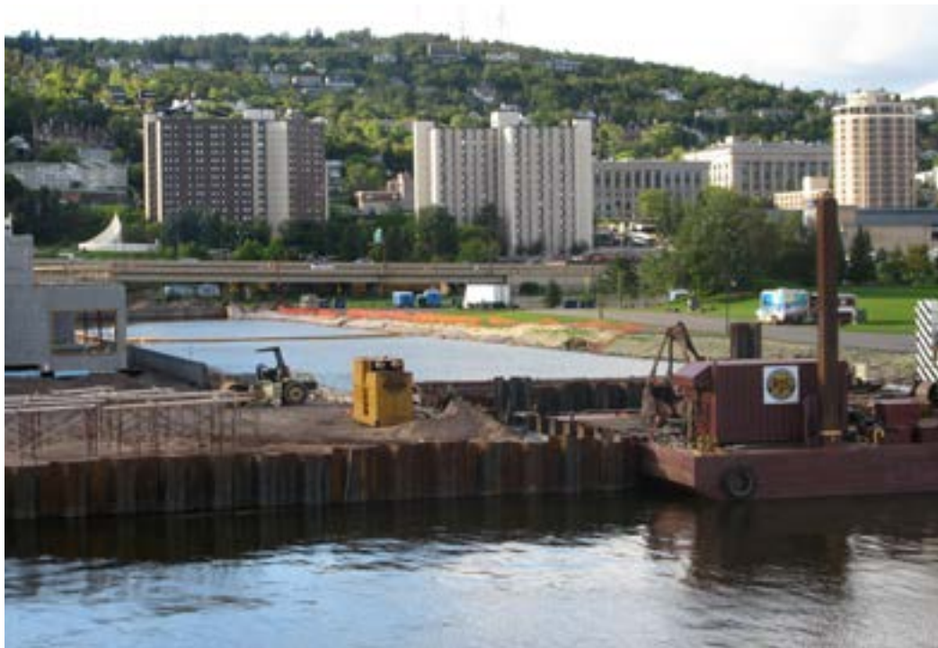
A slip in Duluth harbor undergoes construction to remediate toxic contamination.