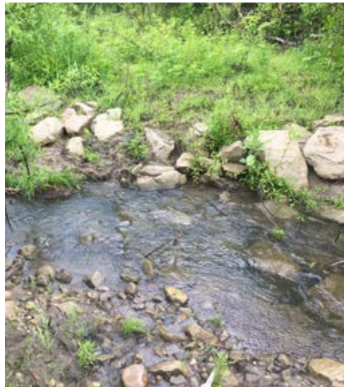
After restoration, installed rock riffles increase connection to natural floodplain, slowing waters down and filtering out sediments.

RESOURCE CHALLENGES ADDRESSED: Invasive species, erosion, stormwater runoff.