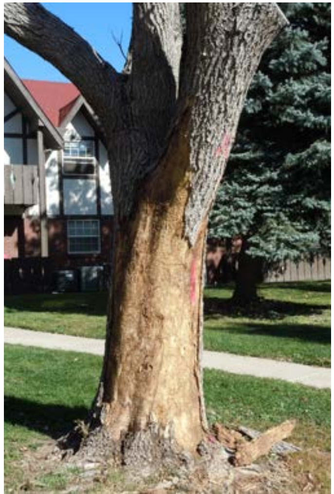
Ash trees, like the ones pictured above, that become infected with the emerald ash borer have to be cut down and destroyed.

RESOURCE CHALLENGES ADDRESSED: Tree loss, habitat loss, and invasive species.