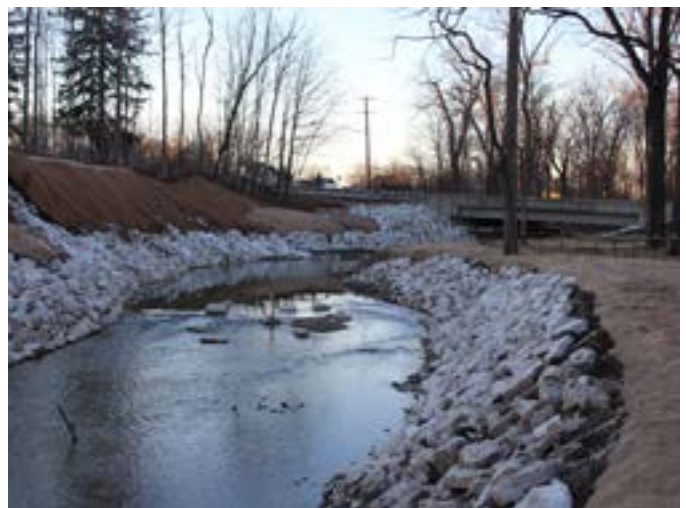
After restoration, streambanks are protected from erosion with rock and, later, native vegetation.

RESULTS AND ACCOMPLISHMENTS: The Kenosha County, Wis., project is reducing erosion and stormwater runoff into the river. Flood events have become more manageable, and damage to the riverbank and the ecology has been mitigated.