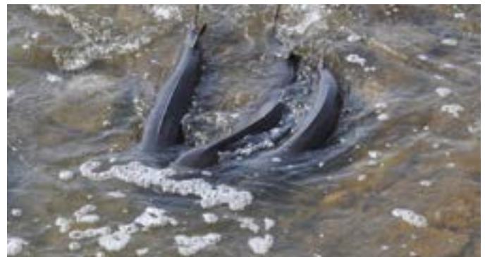
Lake Sturgeon feed on insects, larvae, leeches and other marine life. Once plentiful in the region, the fish suffered steep declines due to habitat loss and overfishing. It is now recovering.

TYPES OF JOBS CREATED: Fishery Biologists, researchers.