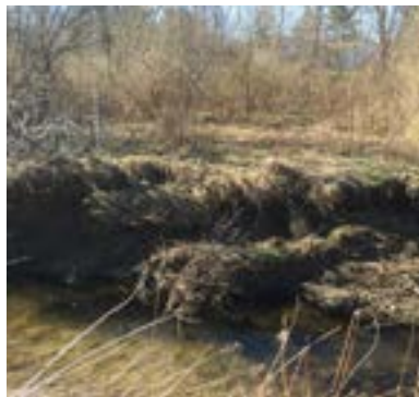
Before restoration, heavy erosion of the streambank offered no floodplain connection, causing silt to wash downstream.

Additionally, sandstone riffles were installed in the stream, increasing the stream's connection to the natural floodplain. The restored connection slows the waters down when it rains, allowing it to go into the riparian area. As it does so, the floodplain filters out pollutants and sediments. The riffle structures also help increase habitat complexity, creating areas with faster moving, more oxygenated water favored by many aquatic insects and small fish.